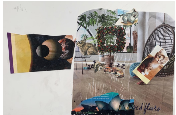
Sheridan Elementary School, Teacher Fellowship Program, 2019.