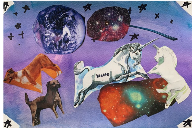
Sheridan Elementary School, Teacher Fellowship Program, 2019.