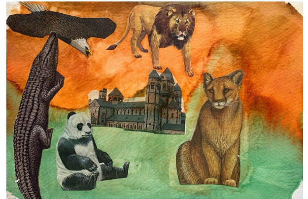
Sheridan Elementary School, Teacher Fellowship Program, 2019.