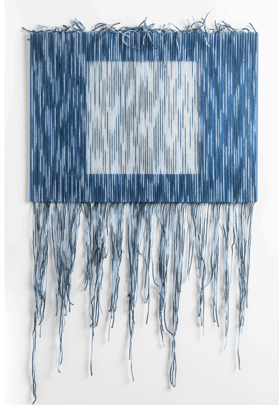
Oostburg High School, Teacher Fellowship Program, 2019.